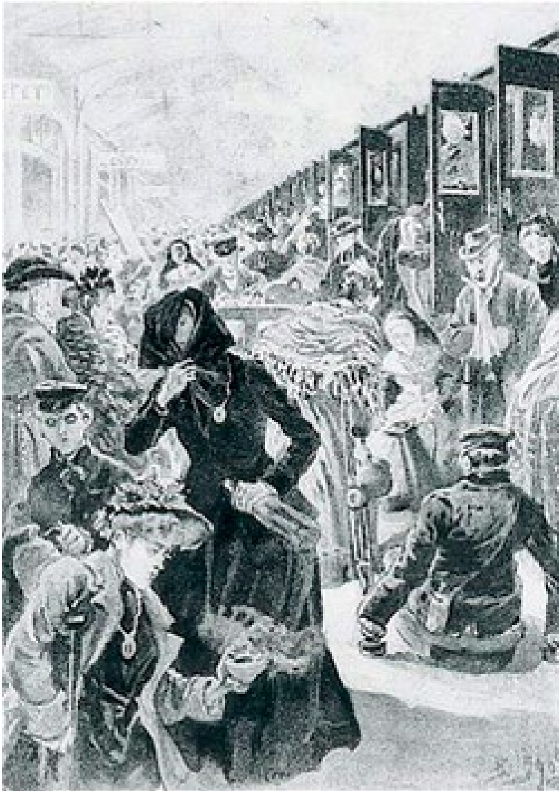
The train's arrival in Lourdes

Many publications disseminated a thought opposed to the Church or even to God. And the train, by its speed and the fire which fed the horsepower of the iron from which it was made, readily passed for an invention of the devil, its beginnings having led to catastrophes and deadly accidents (5). Contrary to common opinion, D'Alzon understood that these two inventions of his time (like the Internet for us) could also do a lot of good and lead many pilgrims to the Virgin of Lourdes.